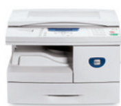
copy | print