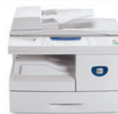
copy | print | scan | fax