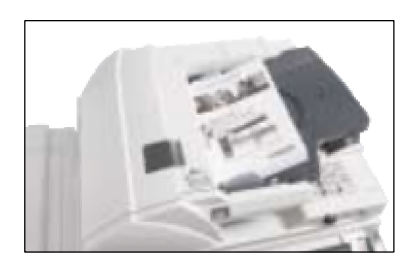
DUAL SCAN DOCUMENT PROCESSOR Offering the segment's first 200 sheet Dual Scan Document Processor, the KM-8030 improves processing speed and input time.