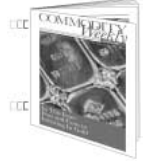
BOOKLET FINISHING Folding and stapling options allow users to create attention-getting booklets with up to 16 sheets.