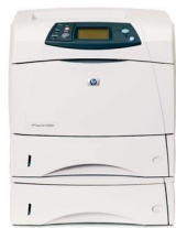
HP LaserJet 4350tn printer