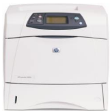
HP LaserJet 4350n printer