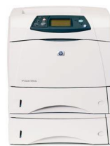
HP LaserJet 4350dtn printer