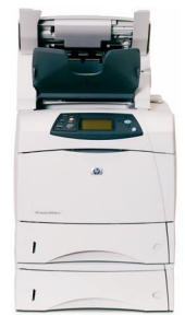
HP LaserJet 4350dtnsl printer