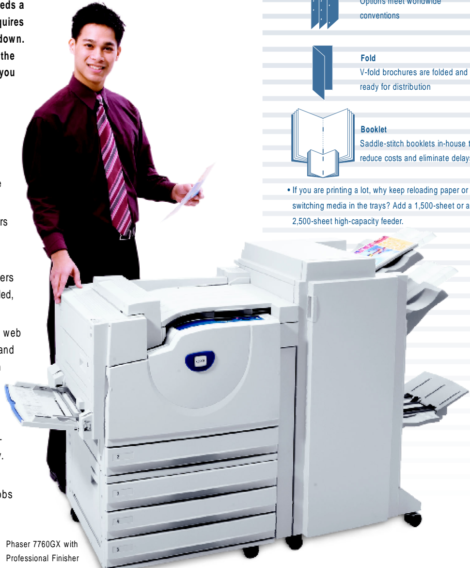
Phaser 7760GX with Professional Finisher